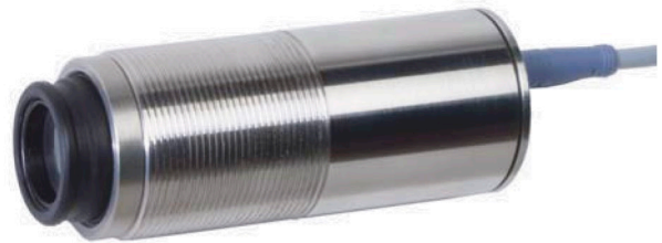
Polaris -Infrared Switch in stainless steel housing